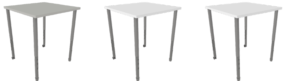
Oyster Grey Polar White White Writeable