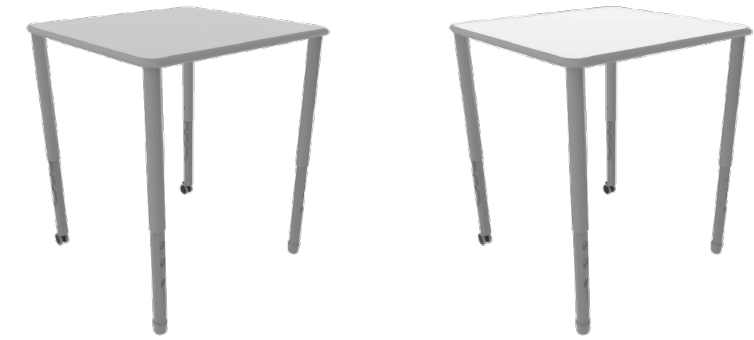
Fog Grey White Writeable