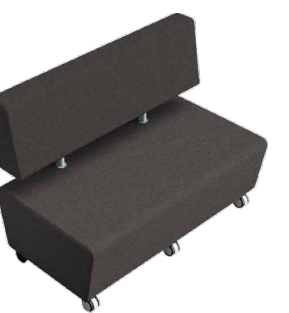
Bloc High Back Lounge