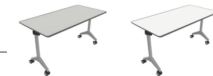
Fog Grey White Writeable

The colours shown have been reproduced to represent actual product colours as accurately as possible, however actual colours may vary. We recommend contacting your Sebel representative for a sample swatch for comparison prior to ordering.