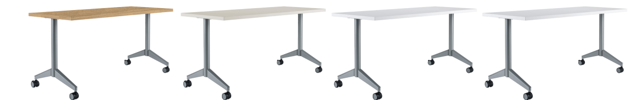
Sublime Teak Oyster Grey Polar White White Writeable