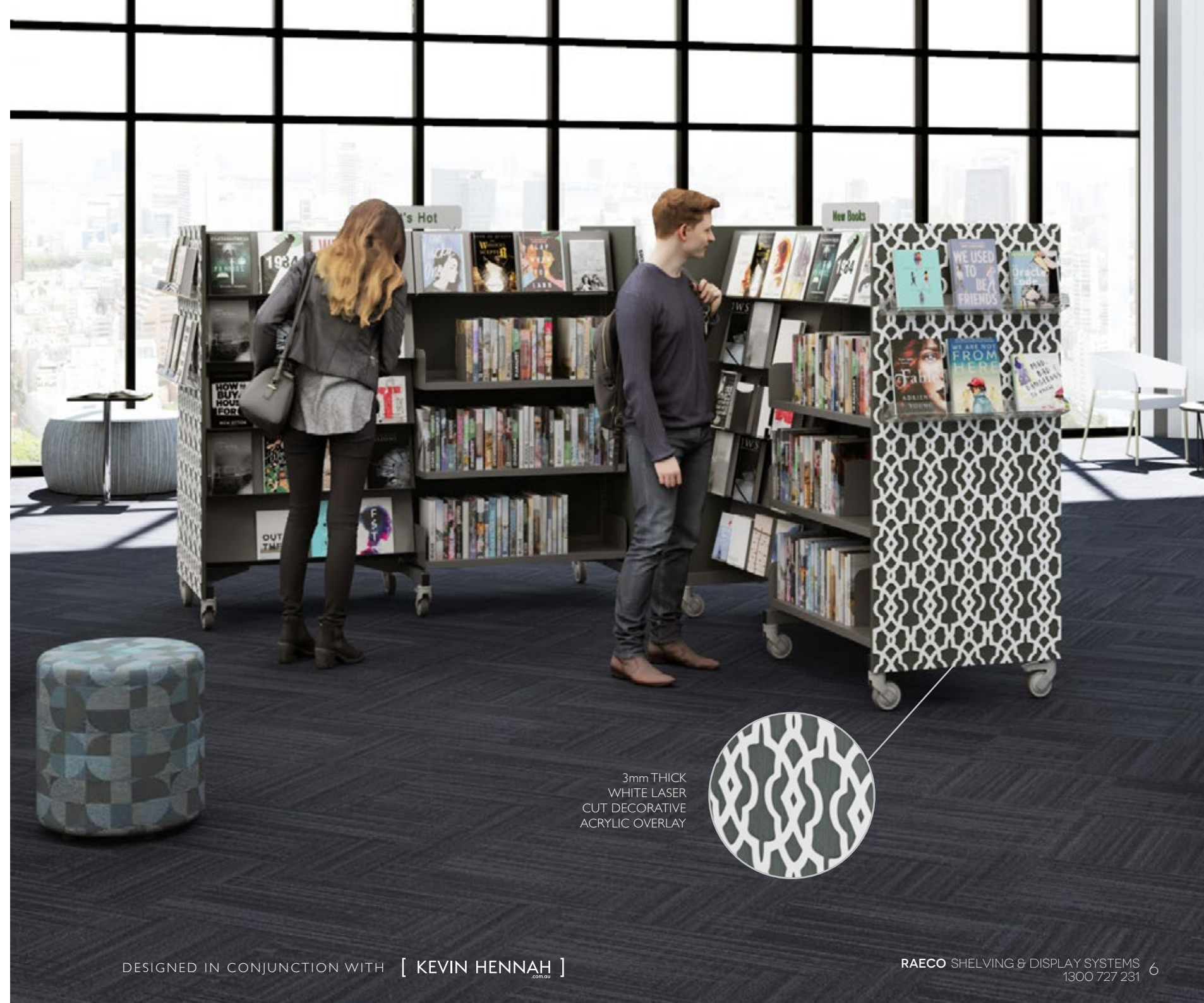
3mm THICK WHITE LASER CUT DECORATIVE ACRYLIC OVERLAY